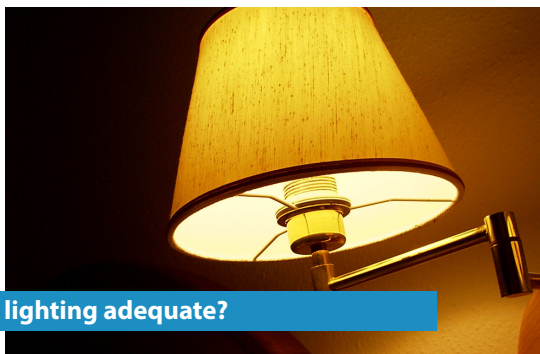
Is lighting adequate?