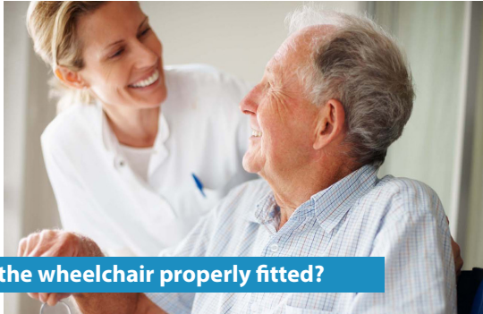
Is the wheelchair properly fitted?

Restraints can cause harm, but there are alternatives. By making informed decisions, we can make resident care safer. Learn about your residents' physical and emotional needs and individualize their care plans to meet needs. Ask questions about each resident in your care, and for those with restraints, use restraint alternatives when possible.