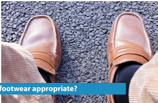
Is footwear appropriate?