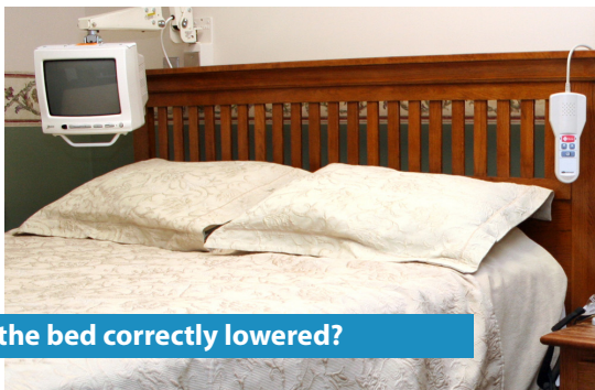
Is the bed correctly lowered?